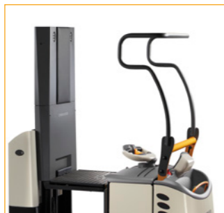
Lifting platform and picking guard (GPC 3040/3060)*