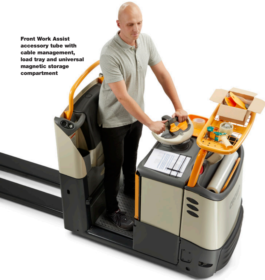
Front Work Assist accessory tube with cable management, load tray and universal magnetic storage compartment

A wide selection of Work Assist accessories adds to the exceptional performance and productivity advantages of the GPC 3000 Series. Crown engineers analysed the broad range of picking tasks and then designed Work Assist accessories which can be application-tailored to enhance convenience, comfort, safety and productivity.