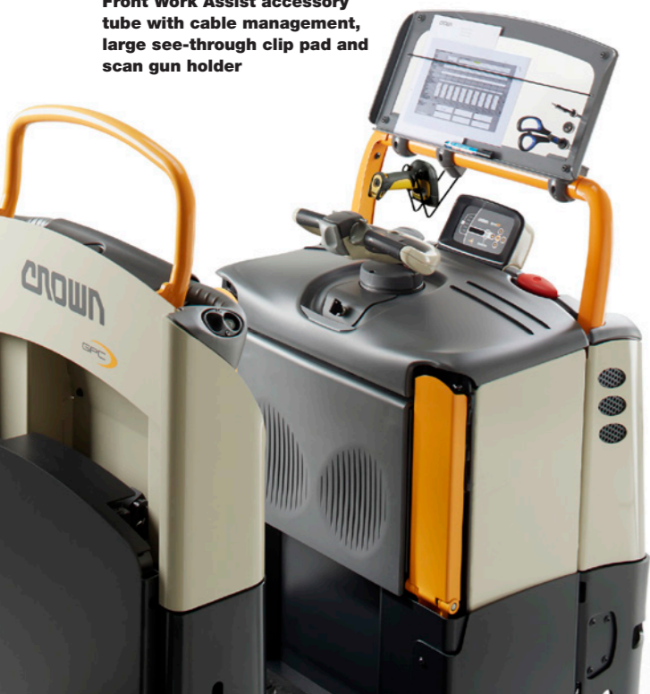
Front Work Assist accessory tube with cable management, large see-through clip pad and scan gun holder

A wide selection of Work Assist accessories adds to the exceptional performance and productivity advantages of the GPC 3000 Series. Crown engineers analysed the broad range of picking tasks and then designed Work Assist accessories which can be application-tailored to enhance convenience, comfort, safety and productivity.