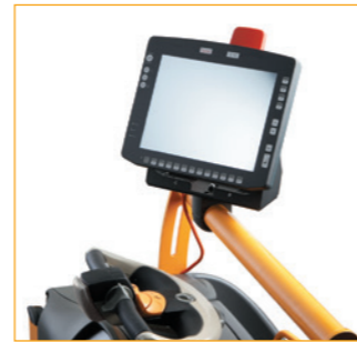
Front Work Assist accessory tube