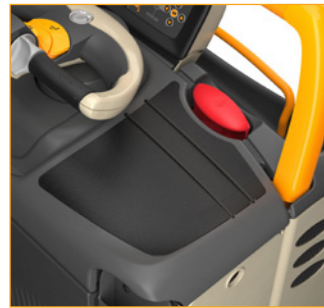
Soft writing mat

You can achieve additional productivity advantages with the many options available for the GPC 3000 Series.