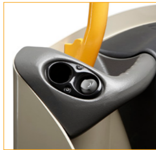
Pick Position Control