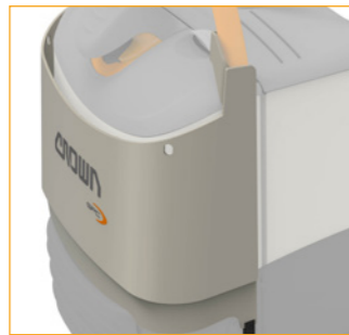
Additional 8 mm heavy duty steel bump protection (GPC 3055)