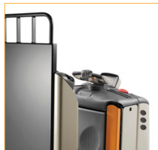
Load backrest (GPC 3040/3060)