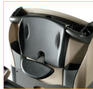
Adjustable lean seat (GPC 3040/3060)