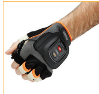
QuickPick Remote Order Picking Technology