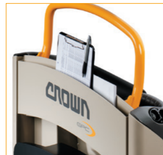
Additional rear storage compartment (GPC 3040/3060)