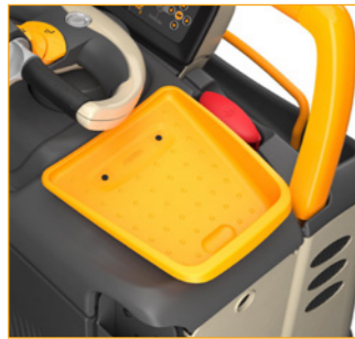
Universal magnetic storage tray