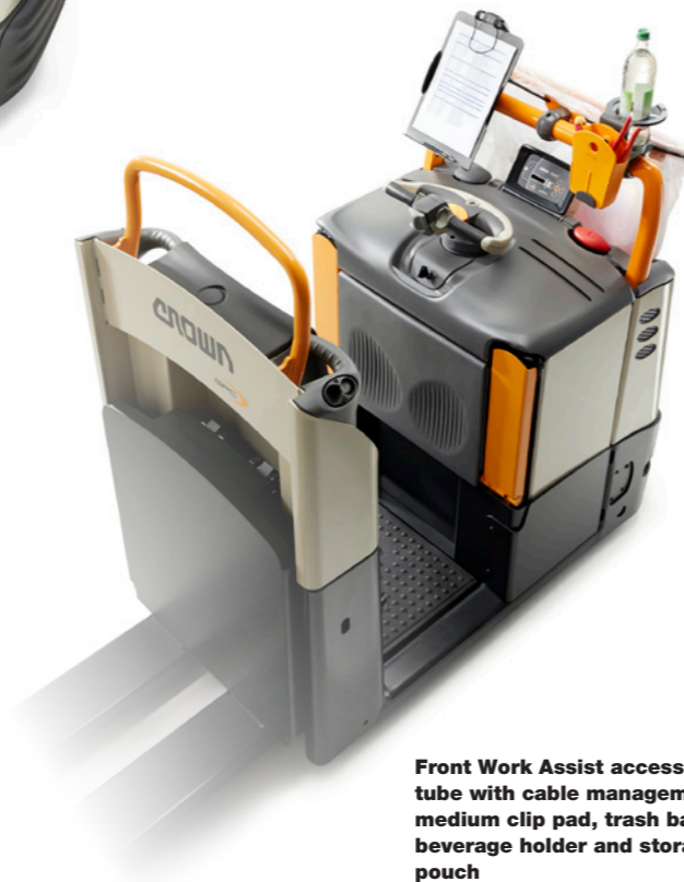
Front Work Assist accessory tube with cable management, medium clip pad, trash bag and beverage holder and storage pouch