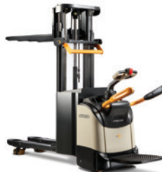
DS/DT Series Double Stacker