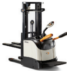
ET/ETi Series Platform Stacker