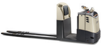
GPC Series Low-level Order Picker