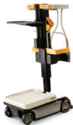
WAV Series Work Assist Vehicle