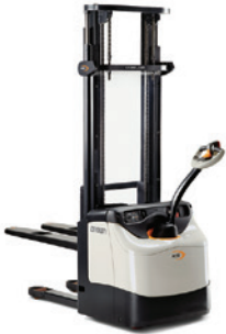
ES/ESi Series Pedestrian Stacker