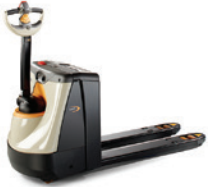
WP Series Powered Pallet Truck