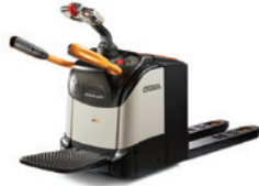
WT Series Powered Pallet Truck