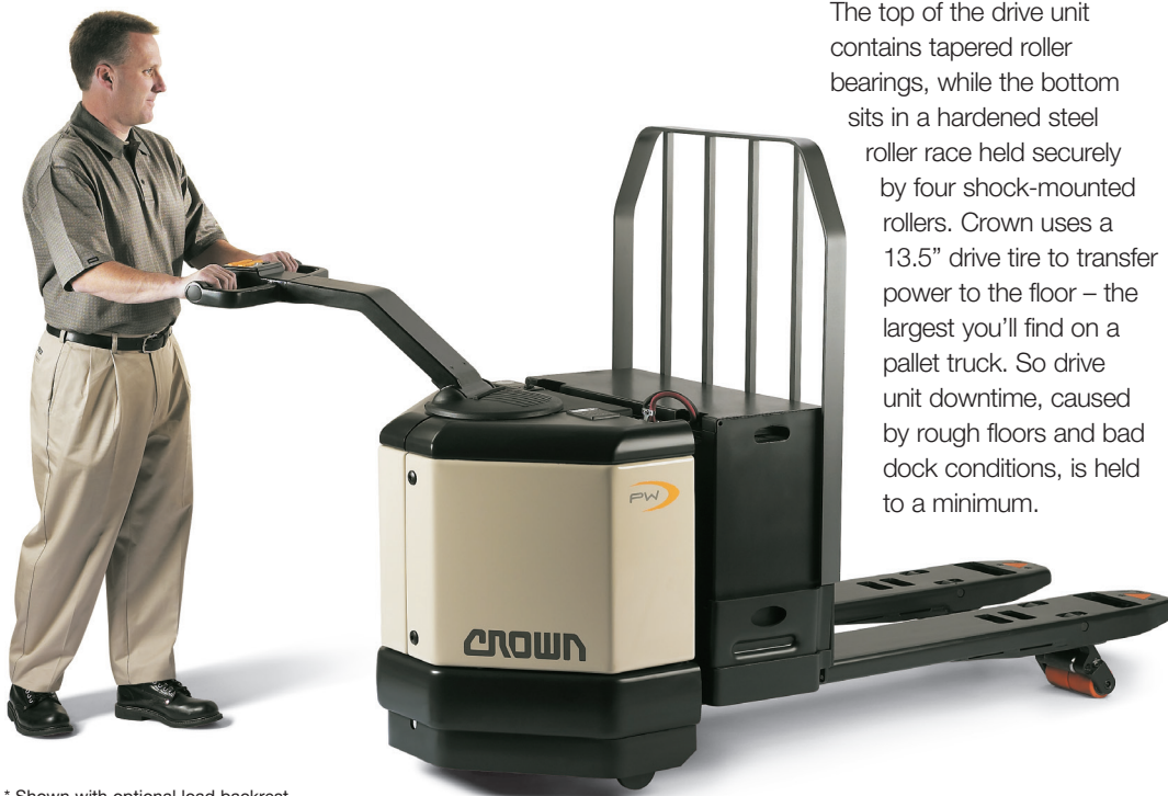
* Shown with optional load backrest