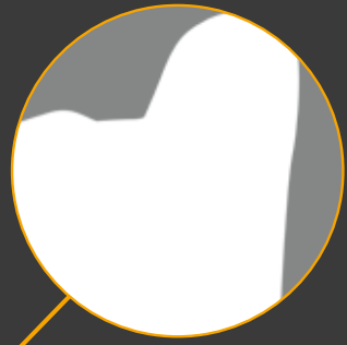
Backrest/Hip Pad – enhances operator comfort while providing flexibility to reposition throughout the shift, hugging the body with contoured padding.