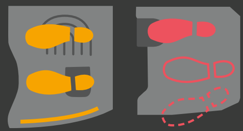
Brake and Presence Pedal – promotes safe operation with a dual-pedal design that discourages operators from using only one foot to operate the truck. Protects both the truck and the operator by automatically applying the brake when the operator's left foot is removed from the brake pedal. The roomier cabin and ability to adjust the position of the feet provide postural relief during travel.

Next page: Enhanced comfort features—FlexRide™ Floorboard and Adjustable Armrest