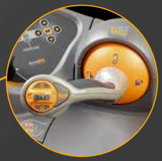
Multi-task Control Handle – features a comfortable grip and allows operators to blend functions.