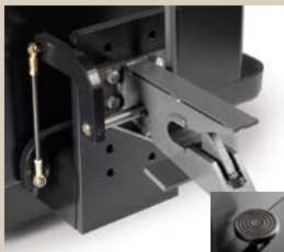
Automatic with Quick Release