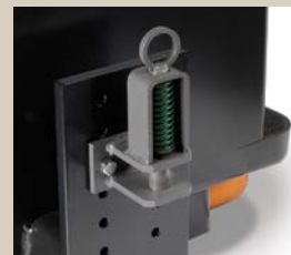
Spring-Loaded Pin and Clevis

Hitches are available in five styles to accommodate the variety of couplers used on towable carts. All hitches are built from premium grade steel for