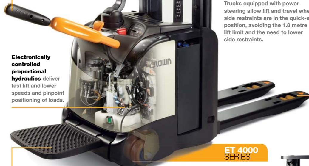
ET 4000 SERIES

Quick-exit side restraints easily swing up so operators can quickly exit to the side in congested areas. Mechanical steering trucks automatically stop lifting at 1.8 metres unless the side restraints are fully down.