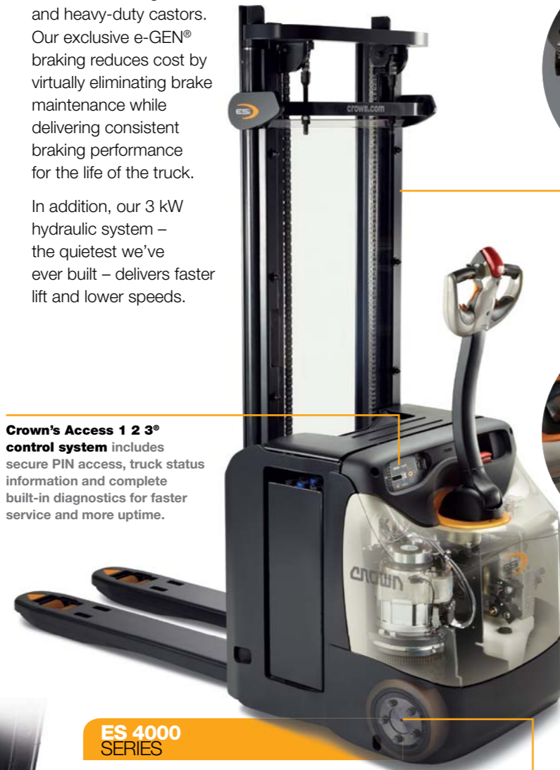
ES 4000 SERIES

Crown's Access 1 2 3° control system includes secure PIN access, truck status information and complete built-in diagnostics for faster service and more uptime.