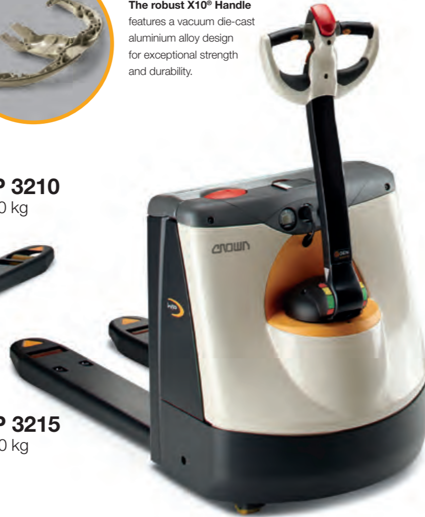
WP 3215 1600 kg