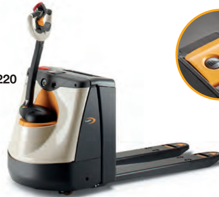
WP 3220 2000 kg