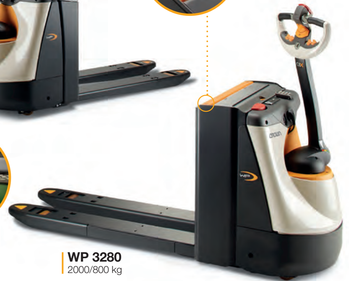
WP 3280 2000/800 kg

The pull-rod lift linkage (certain models only) places the riser axle at the highest point possible to eliminate damage and wear in uneven floor applications.