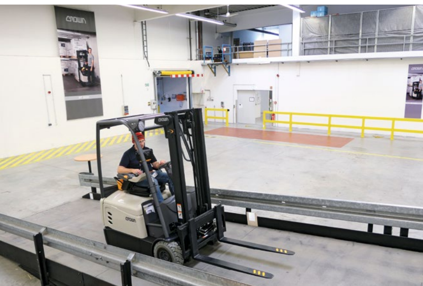
The forklift exhibits impressively smooth starting on ramps, with no rolling back

Marked on the German rating scale from 1 (top score) to 6 (lowest score).