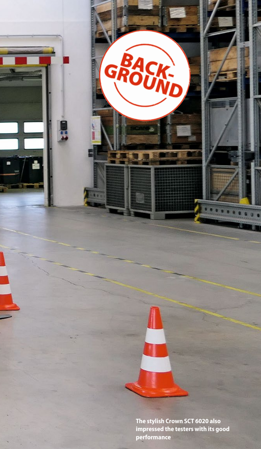
The stylish Crown SCT 6020 also impressed the testers with its good performance