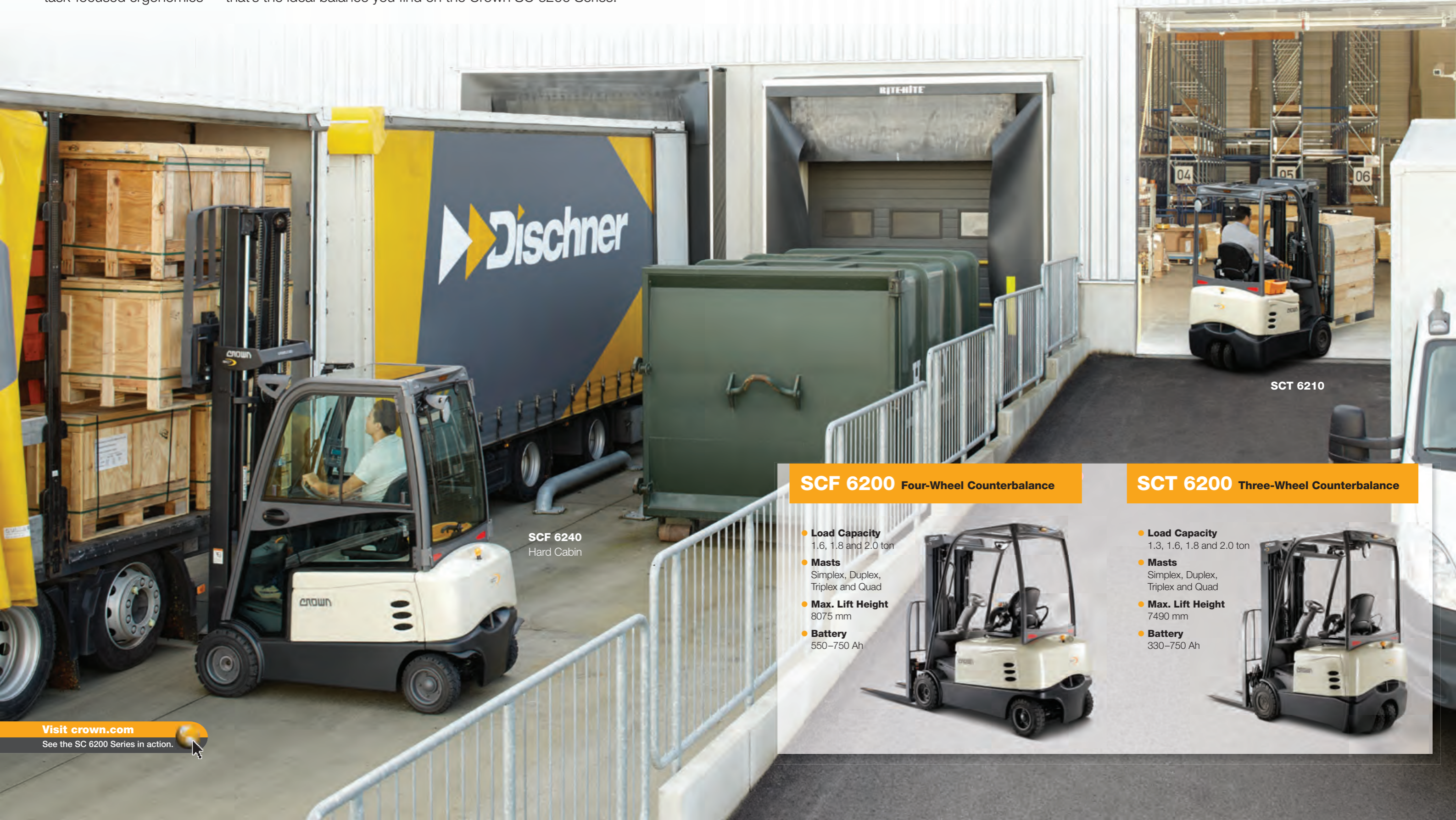
SCF 6240 Hard Cabin

edge on stability and manoeuvrability. Optimise further with options for controls, lights, accessories and more.