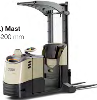
Simplex (TL) Mast Lift Height: 4200 mm