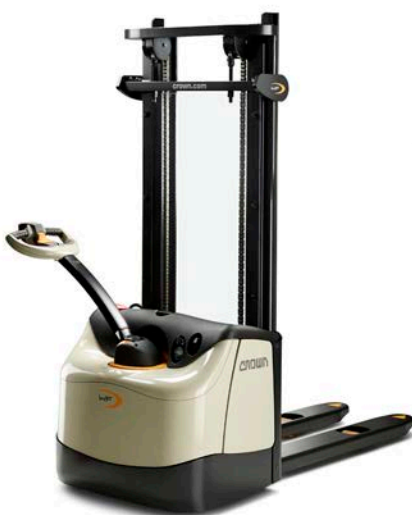
WF 3200 Series 1000 – 1200 kg