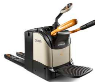
WT 3000 Series Walkie Platform Pallet Truck Load Capacity: 2000 & 2500 kg