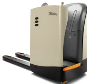
RT 4000 Series Rider Pallet Truck Load Capacity: 2000 kg Forks: Double length available