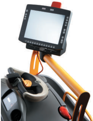
Accessory Clamps / Mountings