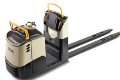
GPC 3000 Series Low Level Order Picker Load Capacity: 2000 to 2700 kg Forks: Available only in double length Platform Lift Available

Available with: • QuickPick Remote System