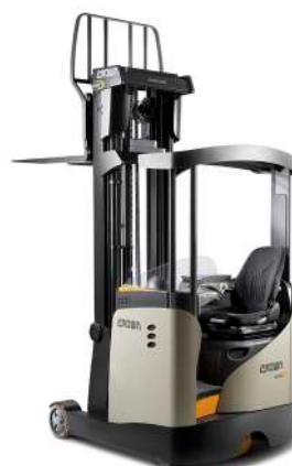
ESR 5200 Series Reach Truck Load Capacity: 1400 to 2000 kg Lift Height: 2760 to 13000 mm