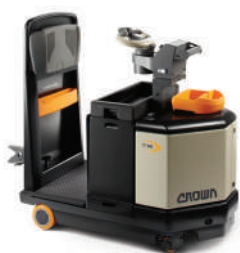
TR 4500 Series Tow Tractor Rolling Load Capacity: 4535 kg Power: Electric 24V

Innovative technology and heavy-duty construction are the cornerstones of Crown's tow tractors, offering proven pulling power and control for manufacturing, warehouse and distribution centre applications.