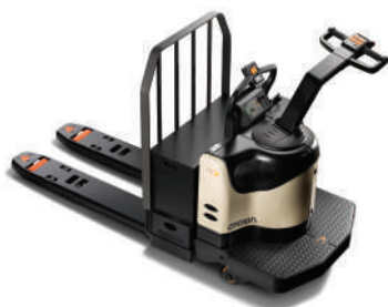
PE 4000/4500 Series End-Control Pallet Truck Load Capacity: 2730 to 3640 kg Forks: Double and triple lengths available Power steering available