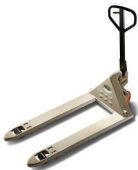
PTH 50 Series Hand Pallet Truck Load Capacity: 2300 kg