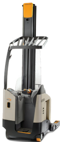
RM 6000 Series MonoLift Mast Reach Truck Load Capacity: 2000 kg Lift Height: 4875 to 10160 mm