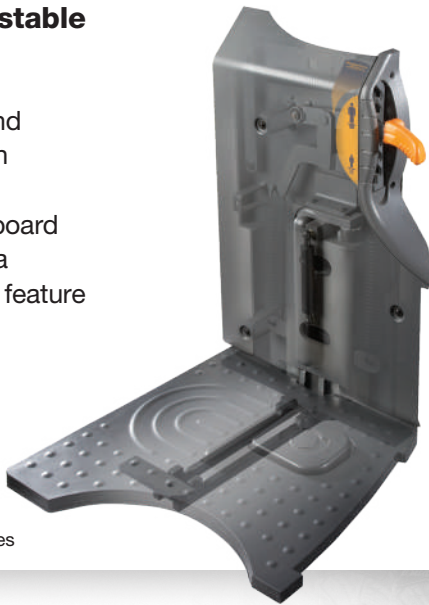
Available on RC 5500 Series

This feature offers improved shock and vibration protection compared to a conventional floorboard and also includes a weight adjustment feature to fit operators of different sizes.