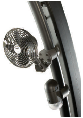
Fans and Lights