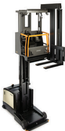
TSP 6500 Series (shown) Turret Stockpicker Load Capacity: 1500 kg Lift Height: 4900 to 13485 mm

Crown can optimize your order-picking process—both on the ground and at high elevations. Excellent driving performance, stability and industry-leading ergonomics allow operators to work productively and confidently.