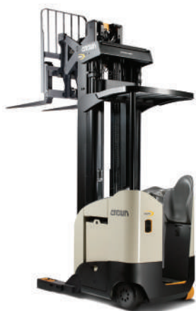
RR 5700 Series Single Reach Truck Load Capacity: 1600 to 2000 kg Lift Height: 5025 to 10160 mm