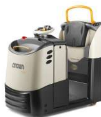
TC 3000 Series Tow Tractor Rolling Load Capacity: 3000 kg Power: Electric 24V

Available with: • QuickPick Remote System