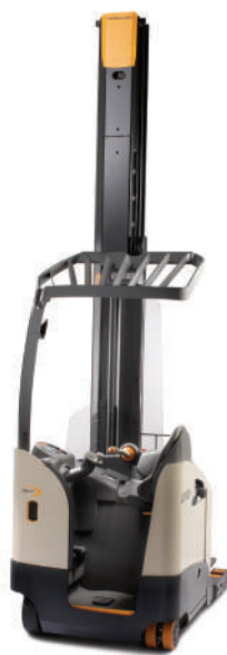
RM 6000S Series MonoLift Mast Reach Truck Load Capacity: 2000 kg Lift Height: 4875 to 12825 mm