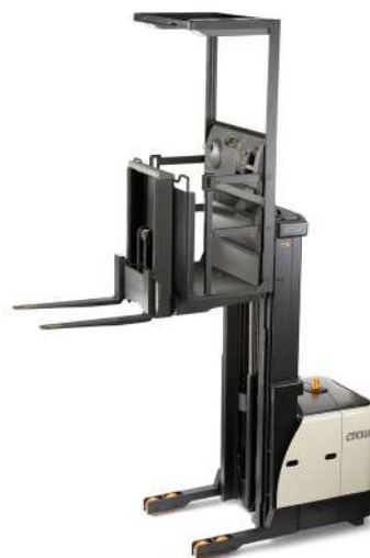
SP 3500 Stockpicker with Lifting Forks Load Capacity: 1000 kg Lift Height: 4215 to 9600 mm