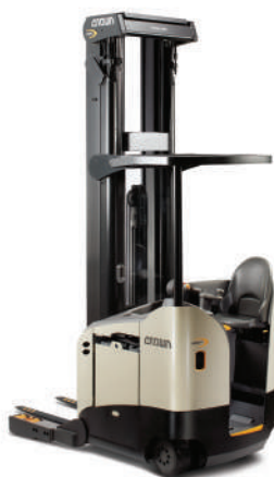
RR 5700S Series Sit-Down Single Reach Truck Load Capacity: 2000 kg Lift Height: 5025 to 11225 mm