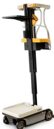
WAV 60 Series Work Assist Vehicle Load Capacity: 135 kg operator 90 kg load tray, 115 kg load deck Platform Lift Height: 2995 mm