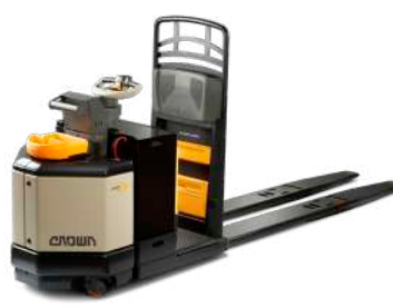
PC 4500 Series Centre-Control Pallet Truck Load Capacity: 2700 to 3600 kg Forks: Double and triple lengths available