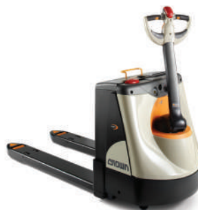
WP 3000 Series Walkie Pallet Truck Load Capacity: 1600 & 2000 kg Lift Height: Up to 750mm