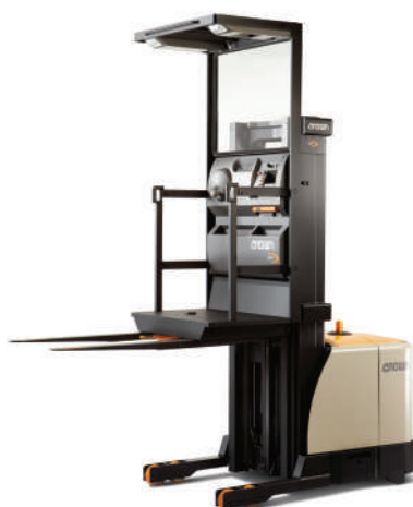
SP 4000 Series Stockpicker Load Capacity: 1360 kg Lift Height: 3450 to 9295 mm