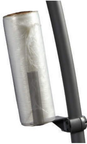
Vertical Shrink Wrap Holders