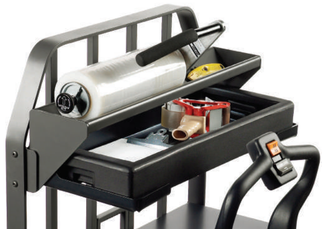
Storage and Shrink Wrap Trays