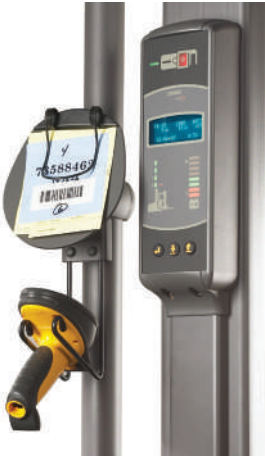
Pad Clips / Scanner Hooks